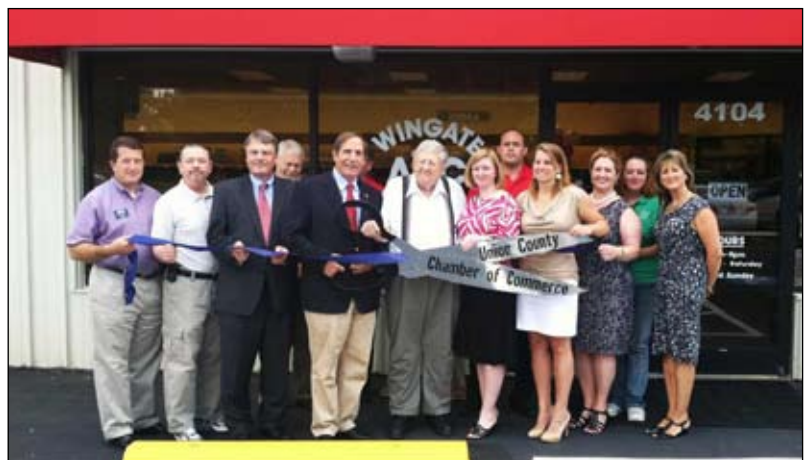
Above: The Wingate ABC Board opens its first store. At Left and Below: The new Durham ABC store held its grand opening in June; the new store replaced the old "counter store" shown at the far right. More Wingate ABC photos on page 4.